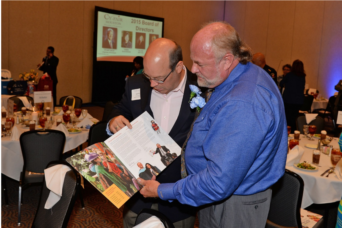
Chamber of Commerce luncheon guests browse the 2015-2016 State of the District brochure, which is available on the district website.

Some eye-opening growth statistics were shared, including our two new high schools planned by 2017-2018 and the more than 47,000 new housing units expected in our community by 2024.