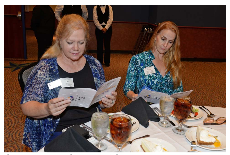
Cy-Fair Houston Chamber of Commerce luncheon guests view the annual State of the District brochure on Sept. 20.

We are a large and growing community that continues to hold fast to the traditional American value of universal public education. 96.91 percent of school-aged children in our community choose public schools. If you look through the resources on our <a href="State of the District webpage">State of the District webpage</a>, I think you'll see why.