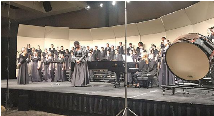
The Cypress Falls HS honor choir performs as a TMEA Honor Choir at the state convention on Feb. 15.