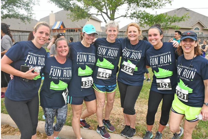
Hamilton MS staff gather after completing the 5K run on March 24.

Student volunteers and performers showcased the service, hard work and talent that our young men and women are known for. District employees planned and organized a top-notch event. They volunteered throughout, gave significant monetary contributions and rallied school running teams.