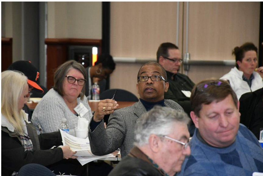
Community members collaborate during a January long-range planning committee meeting.

More information on what is included in the referendum, as well as the detailed recommendation given to the Board , can be found on the LRPC webpage . I encourage you to review the information to help prepare you for an informed vote in May.