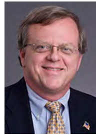
Senator Paul Bettencourt, Senate District 7