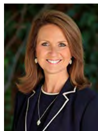
Senator Angela Paxton, Senate District 8