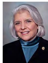
Senator Judith Zaffirini, Senate District 21